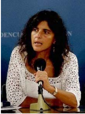
Romina Picolotti, former Minister of Environment, Argentina

supporters of an HFC phase-down under the ozone treaty, are looking to next year's Montreal Protocol meetings to reach agreement.