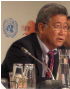
Ambassador Masao Nakayama, Micronesia

The work program also promotes using carbon-negative technologies, such as biosequestration through biochar, in order to bring CO 2 levels back down to 350 ppm and to avoid the consequences of passing tipping points for abrupt climate change.